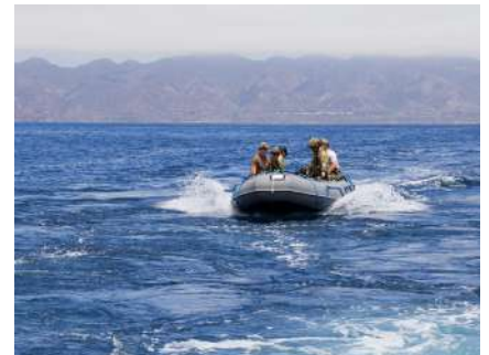
Multinational training participants conduct a diver casualty drill while operating from San Antonio-class amphibious transport dock ship USS Portland (LPD 27), not pictured, as part of Rim of the Pacific (RIMPAC) 2022 in Southern California.