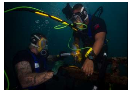
A U.S. Navy diver assigned to Mobile Diving Salvage Unit (MDSU) 1 and a Mexican navy diver conduct hot tap training during Rim of the Pacific (RIMPAC) 2022.