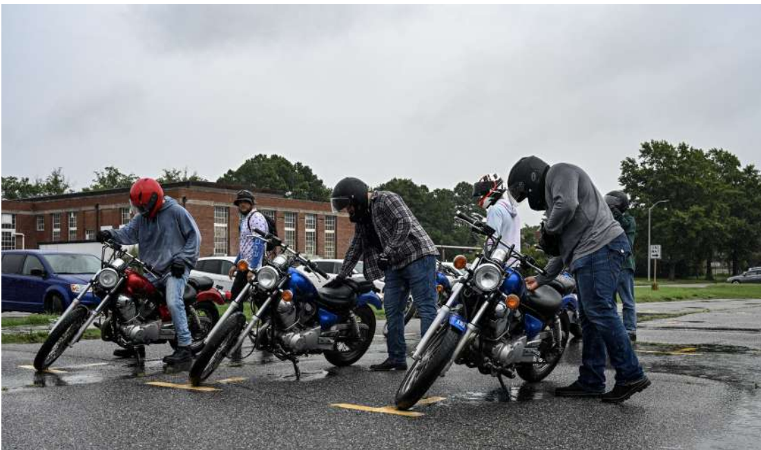
Participants mount their bikes during a safety course hosted by the Mid-Atlantic region motorcycle training team aboard Naval Station Norfolk, Virginia, July 25, 2024. These courses are required for military personnel who intend on operating a motorcycle on and off base and — while they are not required for civilian riders — attendance is heavily encouraged, as the information and practice received provides a solid foundation of proper operation and healthy caution of the risks inherent to motorcycle operation.

It's a call to action for riders to engage, reflect and ask themselves, "What would I have done differently?"