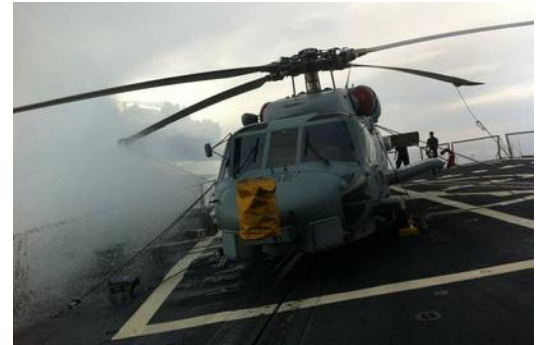
Total # of Mishaps & NMs Related to DDG/H-60 Wave Incursion Since 2014